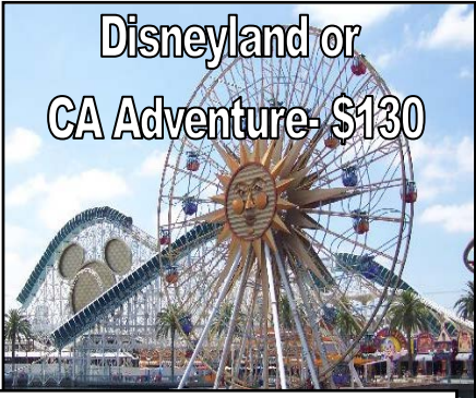
Disneyland or CA Adventure- $130

Laguna Beach & South Coast Plaza: A seaside resort and artist community, known for beautiful beaches, unique shops and famous art galleries. $60