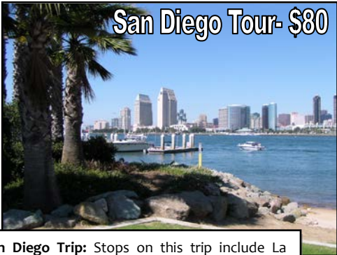
San Diego Tour- $80

Santa Monica Beach: A beach city surrounded by Los Angeles. Enjoy the famous Santa Monica Pier and shopping on the Third Street Promenade. [www.santamonica.com] $70