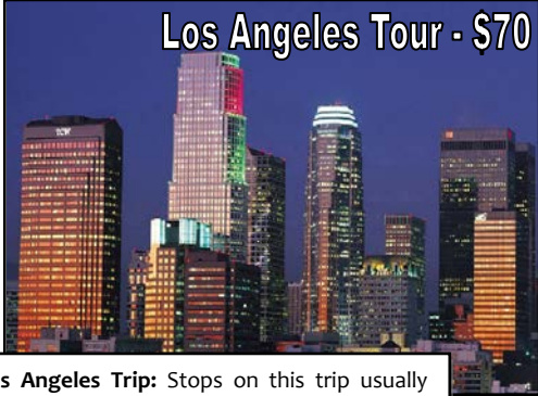
Los Angeles Tour - $70

Cabazon Premium Outlets: A popular outlet shopping center located near Palm Springs featuring high-end brands and affordable prices. [www.premiumoutlets.com] $55