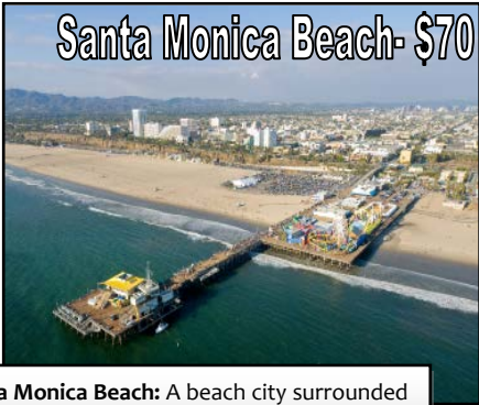
Santa Monica Beach- $70

Disneyland: Walt Disney's original theme park in Anaheim and 'The Happiest Place on Earth!' Disneyland is one of the most popular theme parks in the world! [www.disneyland.com] $130