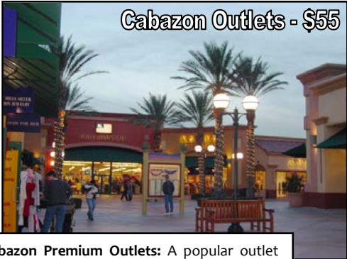
Cabazon Outlets - $55

Cabazon Premium Outlets: A popular outlet shopping center located near Palm Springs featuring high-end brands and affordable prices. [www.premiumoutlets.com] $55