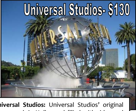
Universal Studios- $130

Knott's Berry Farm: Come visit America's first theme park located in the heart of Southern California and filled with many popular rides. [www.knotts.com] $90