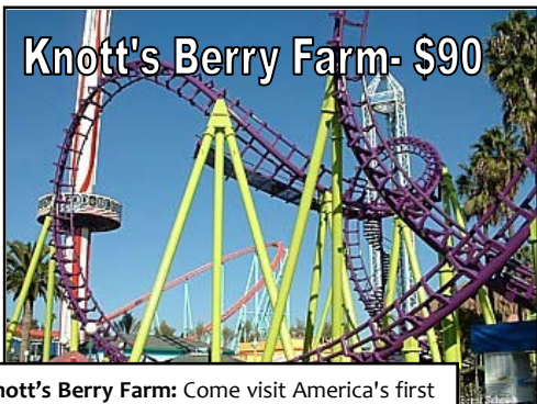
Knott's Berry Farm- $90

Whether you enjoy famous artwork, fast roller coasters or high end shopping, IEP has a trip you will enjoy. IEP trips will take you to some of the most popular and famous destinations in Southern California.