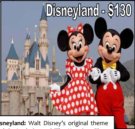
Disneyland - $130

Our professional escorts will make your trips more enjoyable and let you relax. At least one escort will accompany the group on a trip, providing information on the destination, and assistance in case of an emergency.