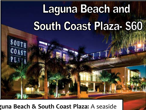
Laguna Beach and South Coast Plaza- $60

Universal Studios: Universal Studios' original theme park in Hollywood filled with rides and attractions that make you feel like a part of the movies. [www.universalstudios.com] $130